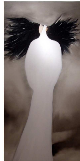
Oil on Canvas 5' x 3'