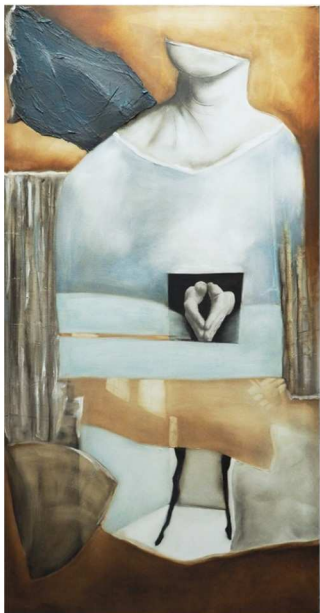
Mixed Media & Oil on Canvas 5' x 3'