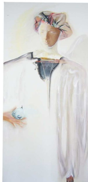
Mixed Media & Oil on Canvas 5' x 3'