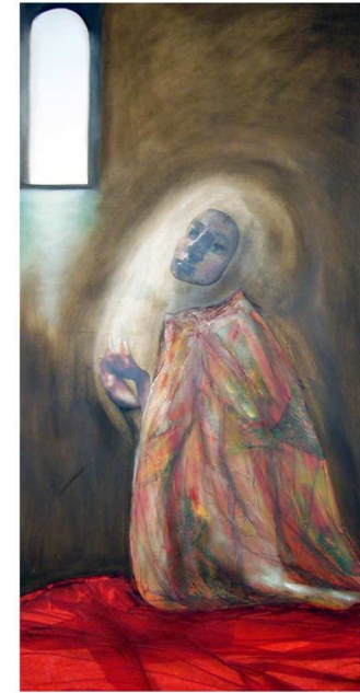
Mixed Media & Oil on Canvas 5' x 3'