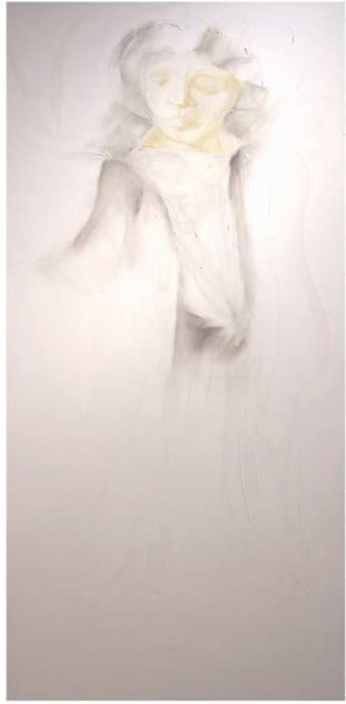
Oil on Canvas 5' x 3'