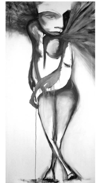
Oil on Canvas 5' x 3'