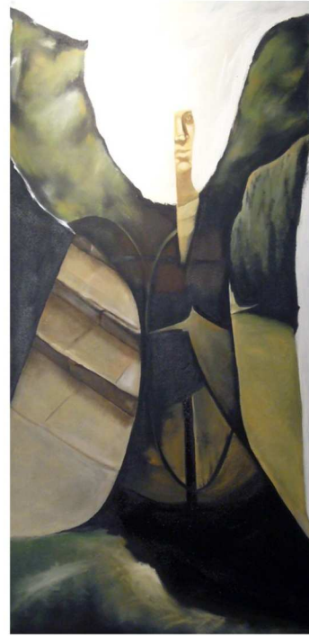
Oil on Canvas 6' x 4'