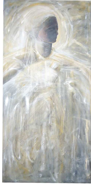
Oil on Canvas 5' x 3'