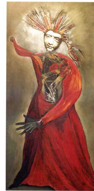
Mixed Media & Oil on Canvas 5' x 3'