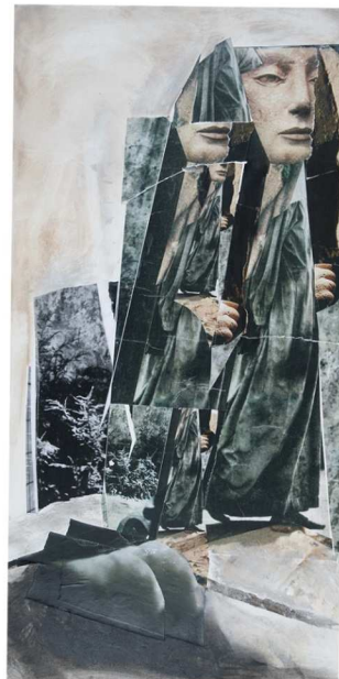
Mixed Media & Acrylic 5' x 3'