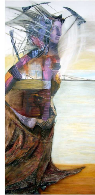
Mixed Media & Oil on Canvas 5' x 3'